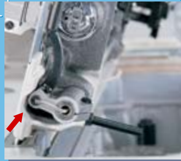
Feed eccentric pin

Enhanced maintainability is ensured by the improved machine head, such as incorporation of an eccentric pin that is used to adjust the feed dog. In addition, the machine is provided with a mounting seat for attachment to improve workability while replacing the attachment and increasing the durability of the machine bed surface.