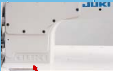
Embossed JUKI mark